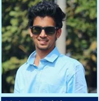
Distinguished Alumnus Mechanical Department RMCET, Ambav.

Mechanical Design Engineer Siemens Limited Liability Company Abu Dhabi, UAE.